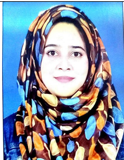
QURAT UL AIN UNIVERSITY