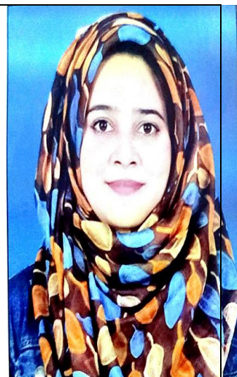
QUART UL AIN